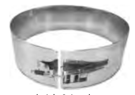
Latch & trunion